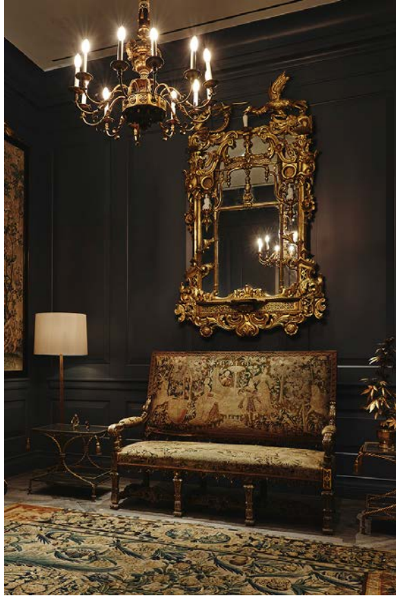
Take a Look Inside the World's Skinniest Skyscraper by SHoP Architects