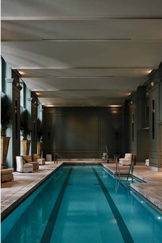
Take a Look Inside the World's Skinniest Skyscraper by SHoP Architects