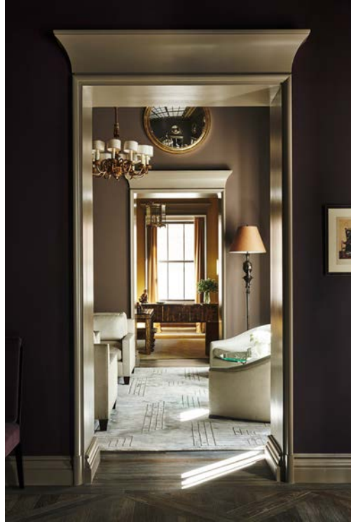
Take a Look Inside the World's Skinniest Skyscraper by SHoP Architects