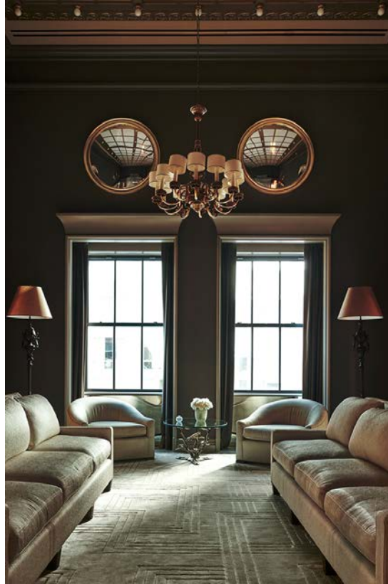
Take a Look Inside the World's Skinniest Skyscraper by SHoP Architects