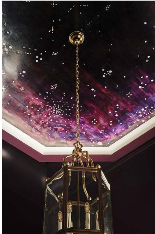
Take a Look Inside the World's Skinniest Skyscraper by SHoP Architects