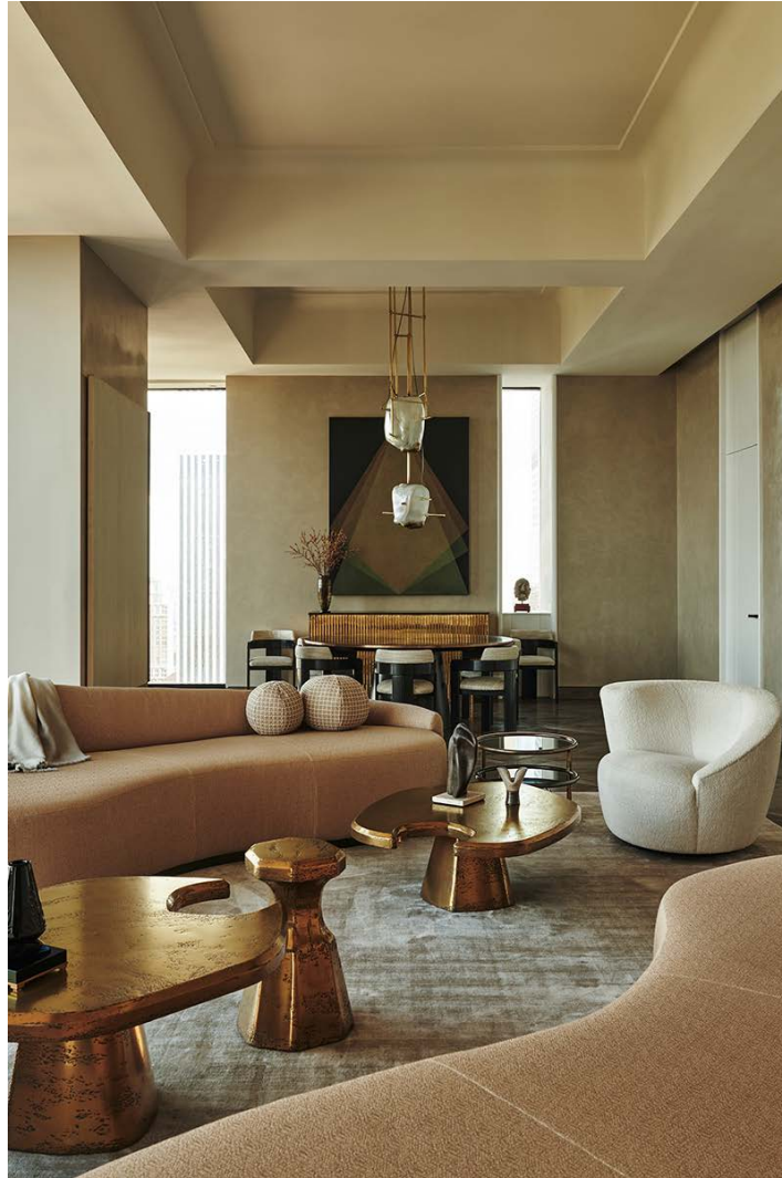
Take a Look Inside the World's Skinniest Skyscraper by SHoP Architects