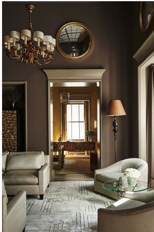
Take a Look Inside the World's Skinniest Skyscraper by SHoP Architects