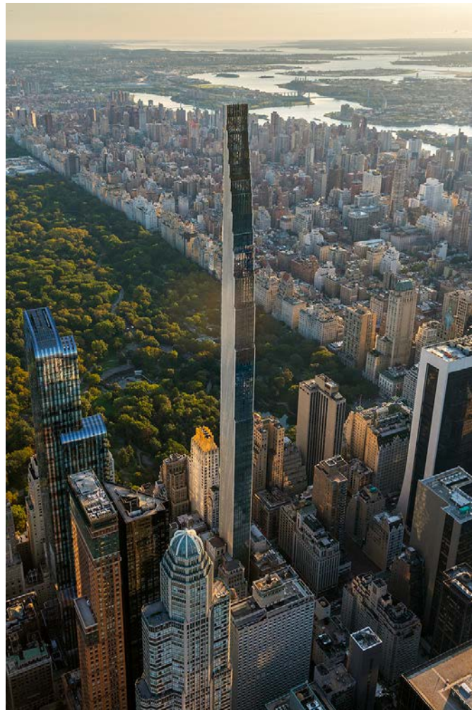
Take a Look Inside the World's Skinniest Skyscraper by SHoP Architects

Take a closer look inside the completed 111 West 57th Street development above with more details to be found here.