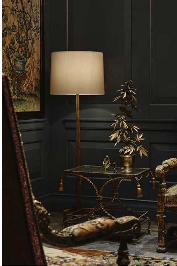
Take a Look Inside the World's Skinniest Skyscraper by SHoP Architects