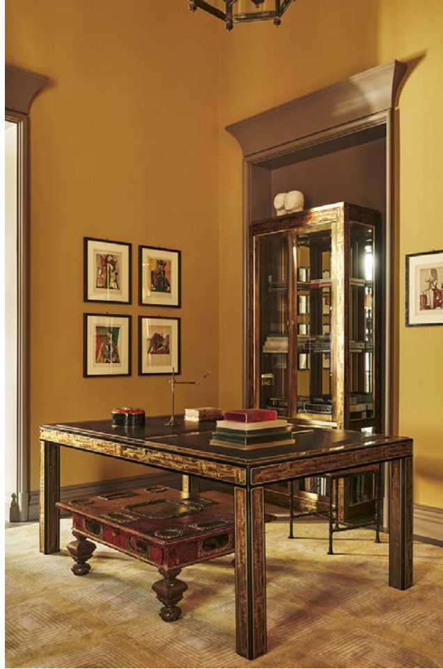
Take a Look Inside the World's Skinniest Skyscraper by SHoP Architects