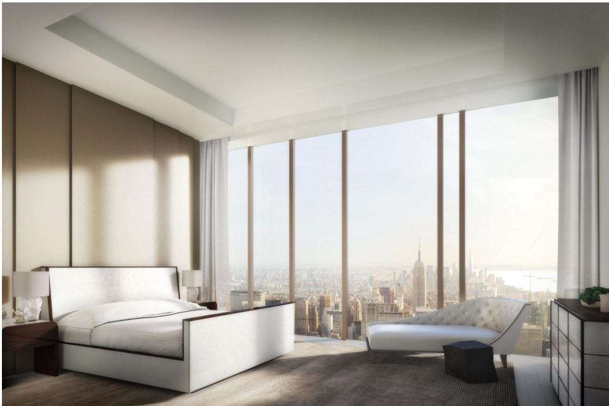
Master Bedroom in one of the suites at 111 West 57th Street

The tower of the skyscraper is a slender beacon rising to a soaring 1,428 feet (this means that it easily falls under the category of "supertall", which describes buildings measuring from 984 to 1,969 feet).