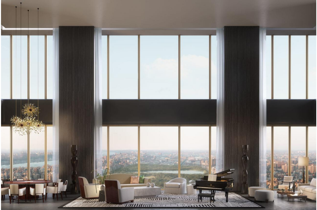
111 West, 57th Street, Duplex Living Room