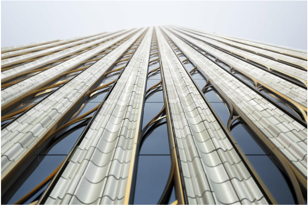
Facade Detail Looking Up 111 West, 57th Street

This façade of terra cotta, glass, and bronze filigree is another nod to the history of the building — harking back to the quality, materiality and details of historic New York towers, whilst also embracing the best in modern technology to push the limits of engineering and construction.