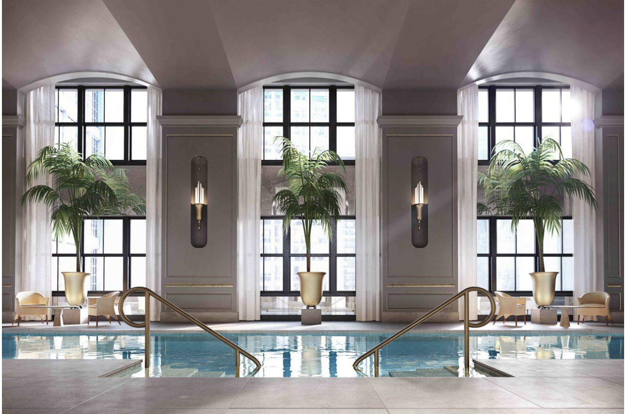
111 West, 57th Street, Daytime Pool