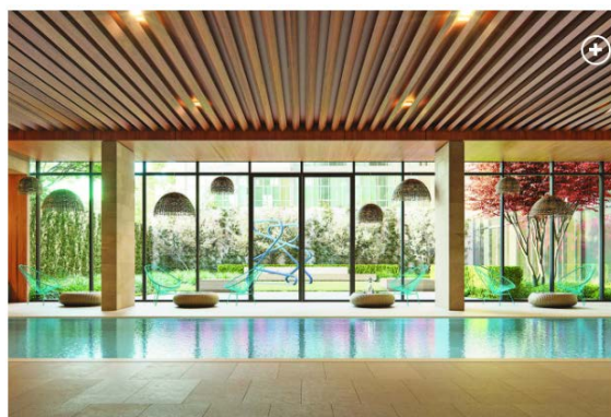
Adam America’s Galerie at 22-18 Jackson Ave.